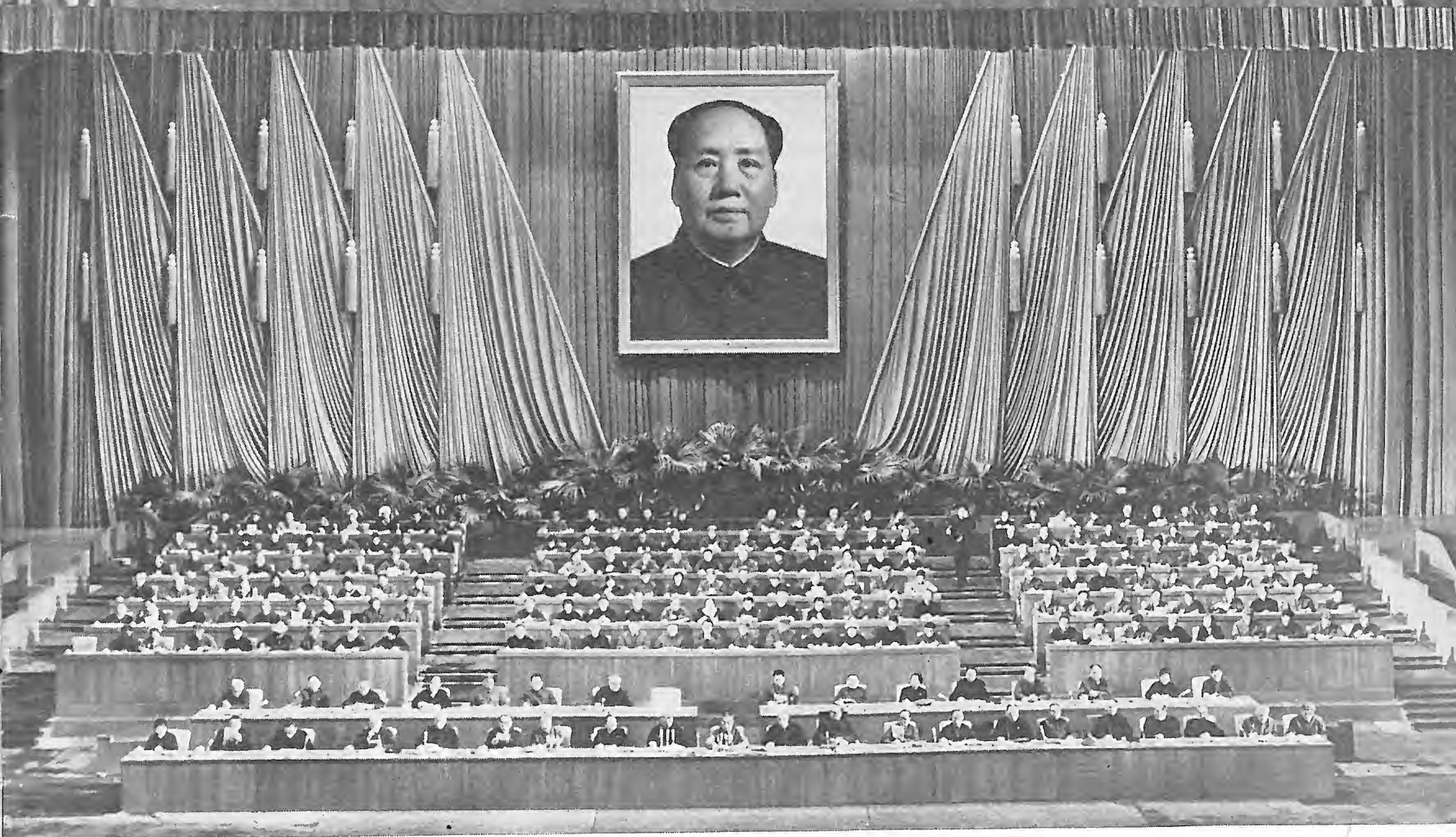
The rostrum at the First Session of the Fourth National People's Congress of the People's Republic of China, held in the Great Hall of the People, Peking, from January 13 to 17, 1975.